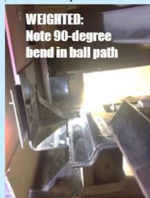
WEIGHTED: Note 90-degree bend in ball path

Look directly to the left inside your Dynamo table’s Ball View Door opening.