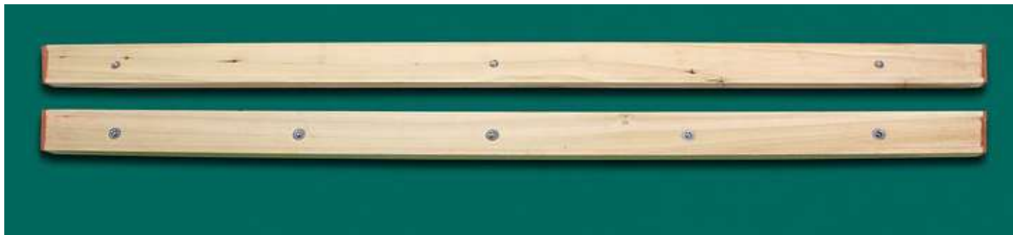
Top – Dynamo Rail - Bottom – Valley 5-bolt rail

The “three bolts that matter” to the Dynamo owner are in the correct places on a Valley rail set.